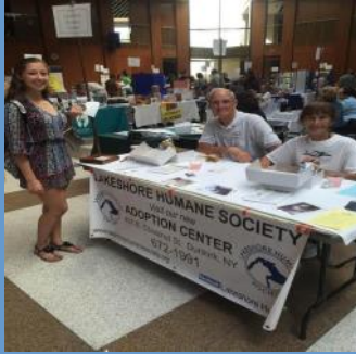
Lakeshore Humane Society at Fall 2016 Community Service Fair