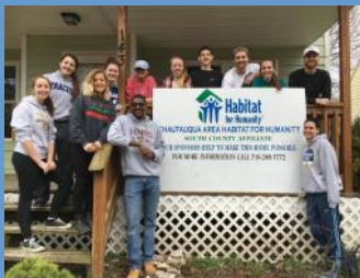
Habitat for Humanity Club rehab home Jamestown, NY