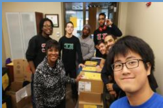
Kappa Sigma Phi loading donated food for the Feeding Fredonia Challenge