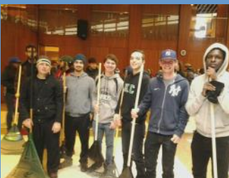
Days of Service Students volunteer for Fall Sweep